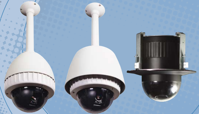
HSGN-502 HSGN-502SH HSG-502F